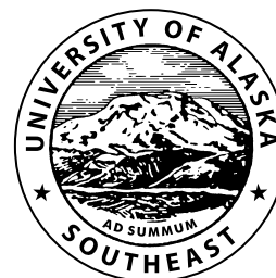
{The UAS Seal}

Consistent use of the logo will result in increased recognition and communicate UAS quality and value to all audiences.