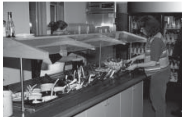
The Mourant Cafe's salad bar offers the freshest ingredients daily.

Food service is available only on the Juneau campus. The cafeteria is located in the Mourant Building, with meal service available Monday-Friday from 8:00am – 7:00pm. Coffee, snacks, breakfast, lunch and dinner are available at reasonable prices. The semester declining balance meal plan is mandatory for Banfield Hall and the Freshman Honors Building residents. See housing rates for costs. Housing students can also use their declining balance meal plan at the Student Housing Lodge convenience stores when the cafeteria is not open. For students, faculty, and staff who do not have a meal plan, a declining balance convenience card is available. See the Housing office, lower level Mourant, for more details