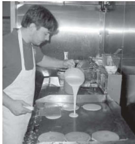
Breakfast, lunch and dinner plus plenty of snacks are offered at the Mourant Cafe.