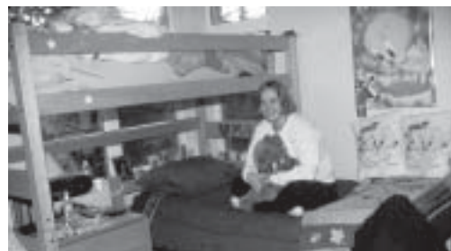
Freshmen in double rooms enjoy comfortable private space plus room to study.

Students may not check out of the apartments mid-semester without incurring a substantial financial penalty. The Housing agreement is for a full academic year and includes the meal plan for Banfield Hall students and Freshman Honors Building.