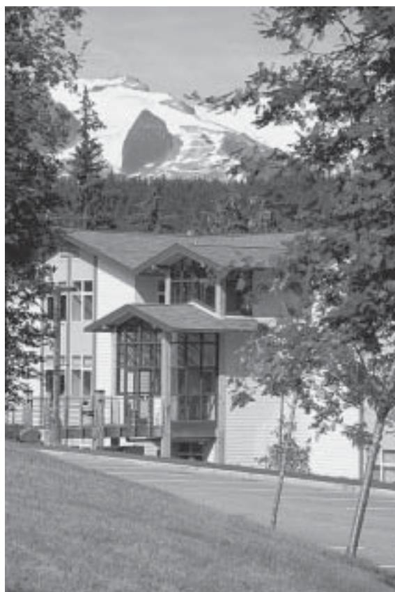
Freshmen at campus housing live in Banfield Hall.