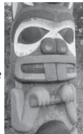
Examples of Northwest coast art are displayed on campus.

Student Activities Center fee (non-refundable) 7 credits or more: $100 (automatically charged) 1-6 credits: Students are not members and must pay a fee to use facility. Memberships can be purchased for semester, punch card, or daily pass.