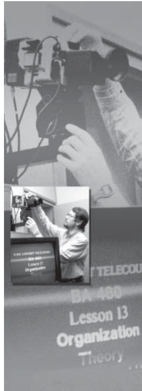
UAS Distance Learning programs feature state-of-the-art equipment staffed by professionals.

Personal Expenses: A student should budget for clothing, laundry, medical and dental expenses, recreation, personal supplies, and other items. An allowance of $1,035 per academic year is usually sufficient.