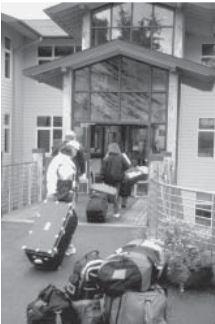
Moving-in day at Banfield Hall.

Assignments to student housing are made prior to the start of each semester. Students will be informed, in writing, of the details of their assignment before they arrive. Priority is given on a first come, first serve basis once an application and deposit have been received. Assignments will not be made unless an application is complete. This means that a signed housing agreement and proof of current immunizations have been received. All efforts will be made to honor special housing requests such as roommate preferences, however last minute applications with special requests may not be able to be accommodated.