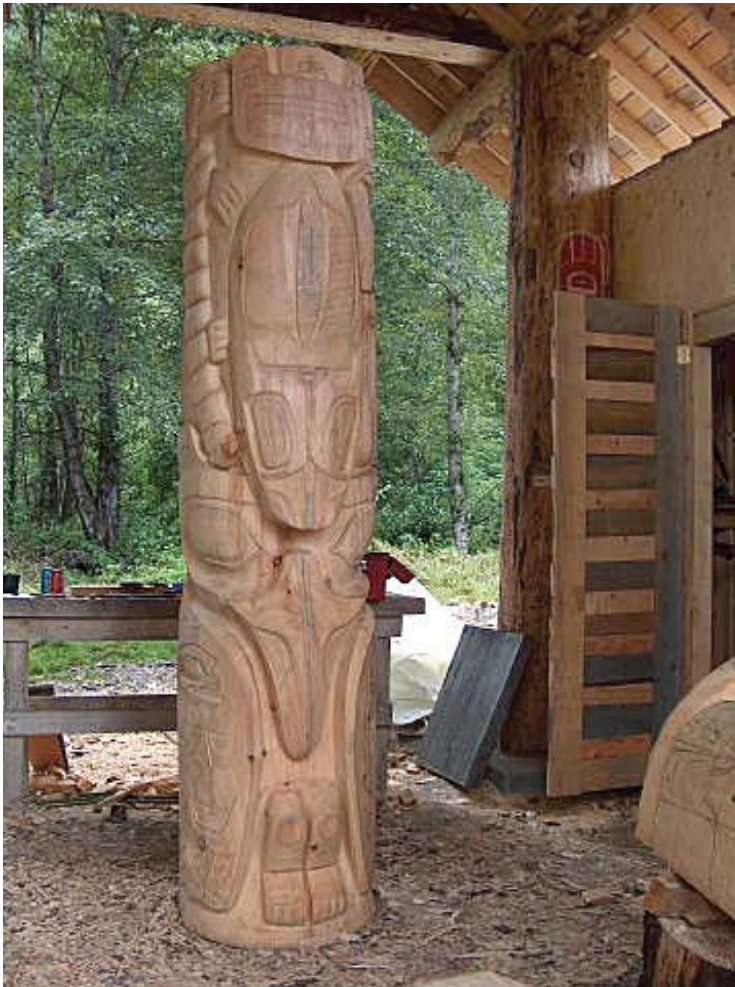
The Raven House Post is stood up during the carving process to see how it looks from the upright perspective.