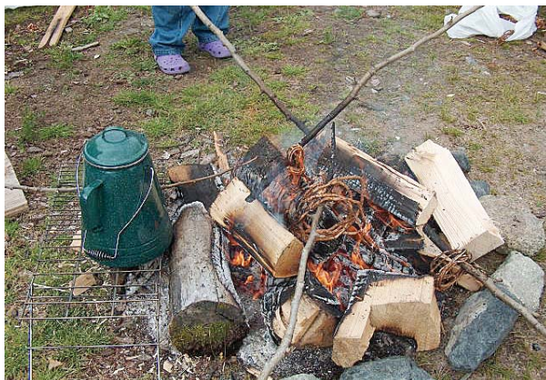
Spruce Roots are roasted on the fire much like one would roast a marshmallow at a camp fire.