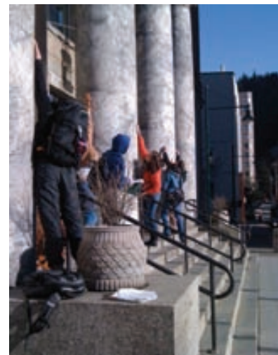
GEOL 104 Physical Geology students measure the effects of chemical weathering on the Capitol Building marble columns and identify the building-facing stone of the Mendenhall Apartments during a recent Geology lab in downtown Juneau.