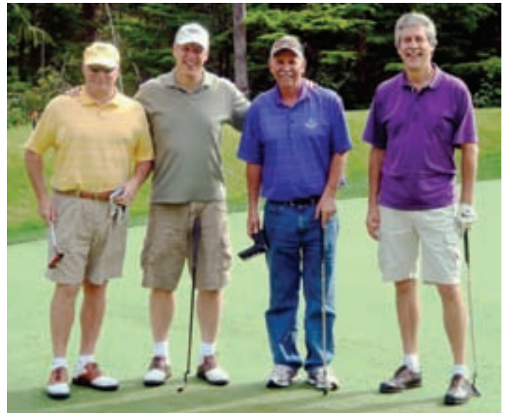
Golf Tournament Winners