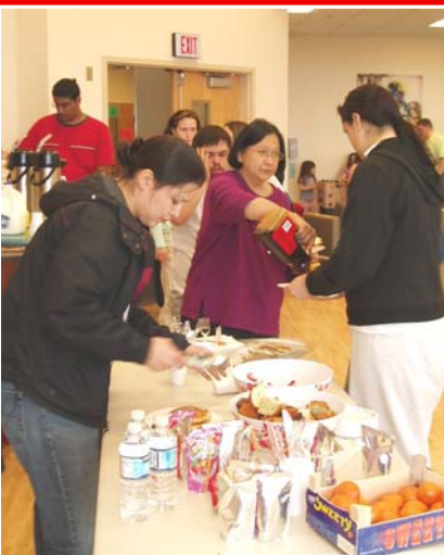
Right: Breakfast line! The strawberry and blueberry fruit salad went fast!